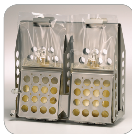
DH8 Basket With Frozen Plasma