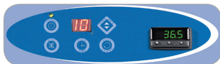
QuickThaw Control Panel for DH2