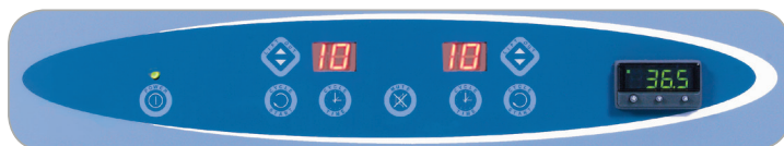
QuickThaw Control Panel for DH4 and DH8